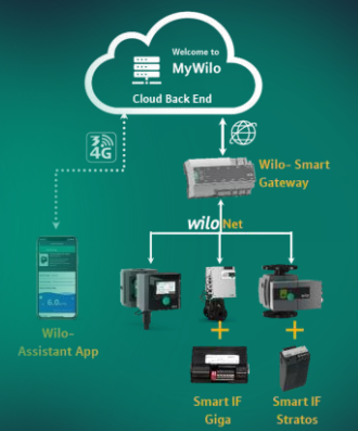
150 wilo Loving Traditions. Living Innovations.