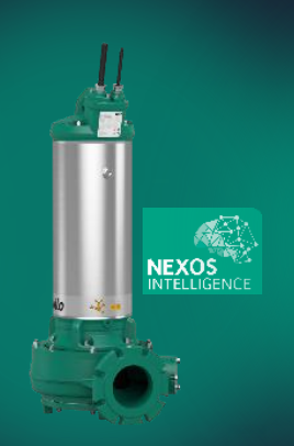
Wilo-Rexa SOLID Q with Nexos-Intelligence