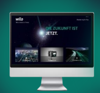
Wilo-Web including Wilo-Select